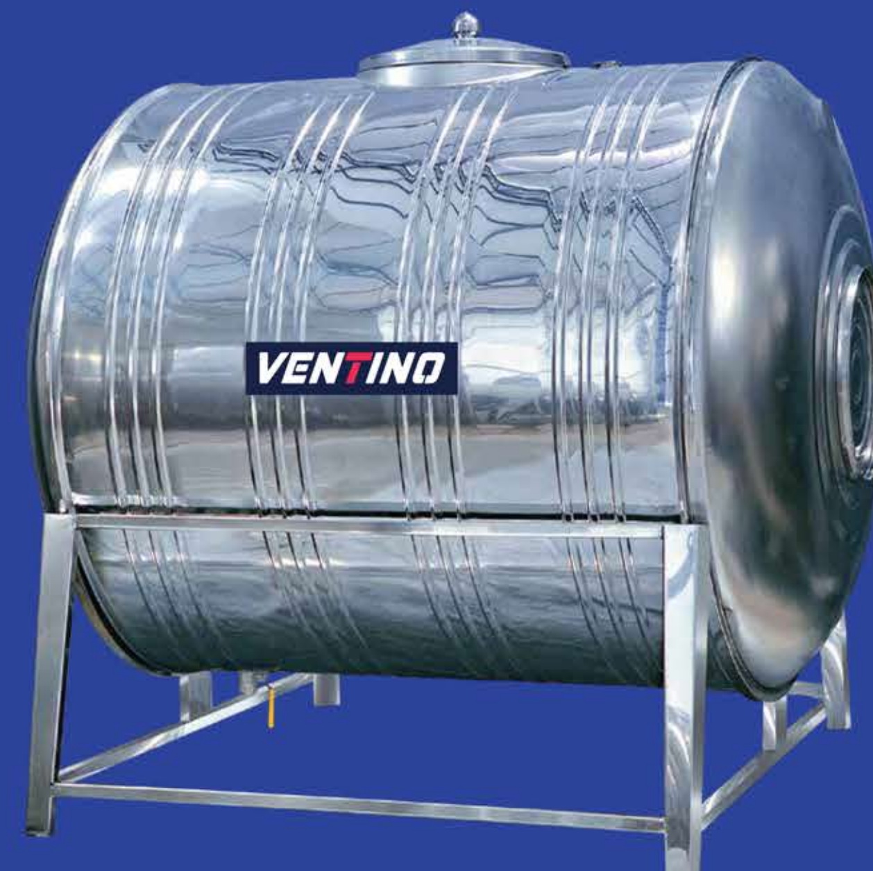
1500 Ltr Horizontal