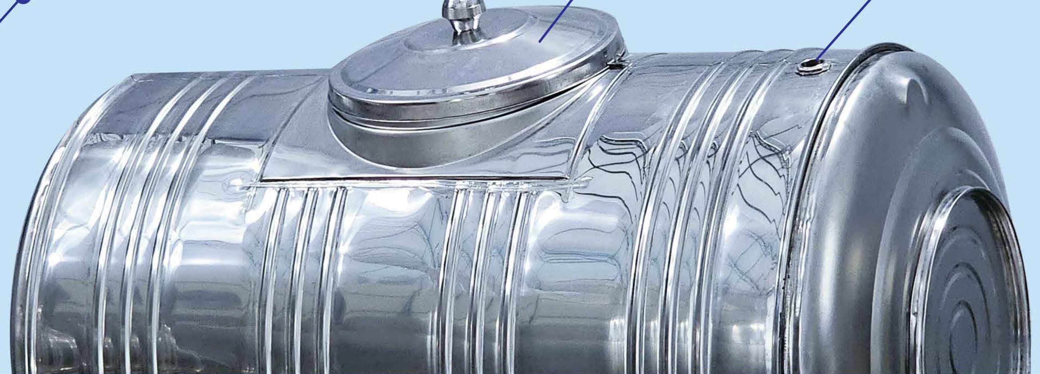
Top Dish of Horizontal Tank