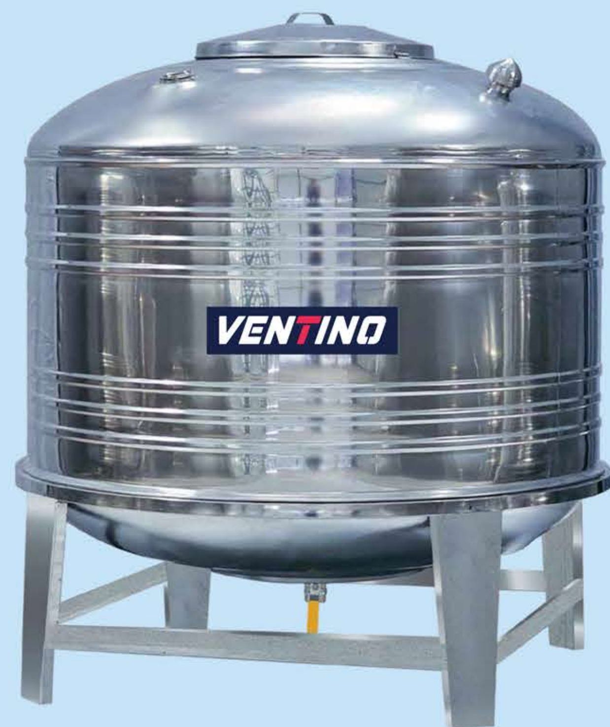
500 Ltr Vertical-sm