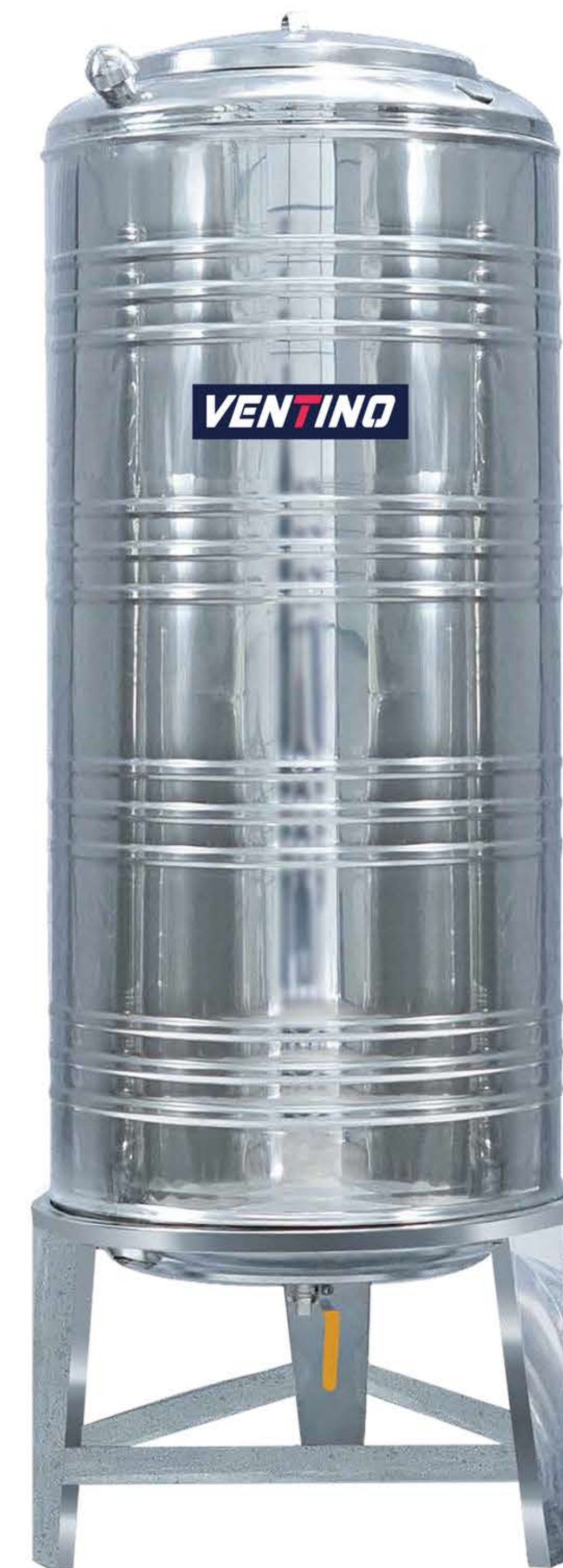
300 Ltr Vertical