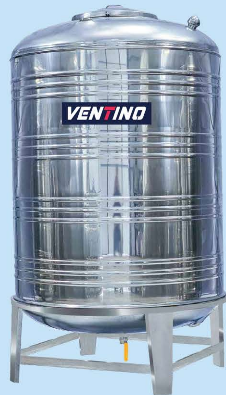
1000 Ltr Vertical