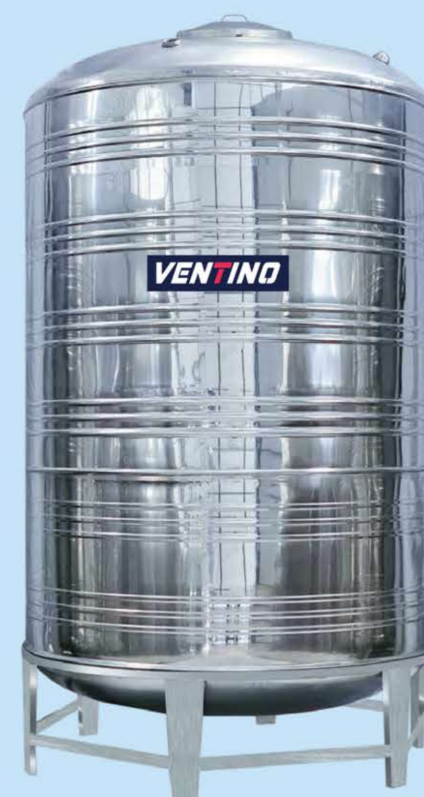
3000 Ltr Vertical