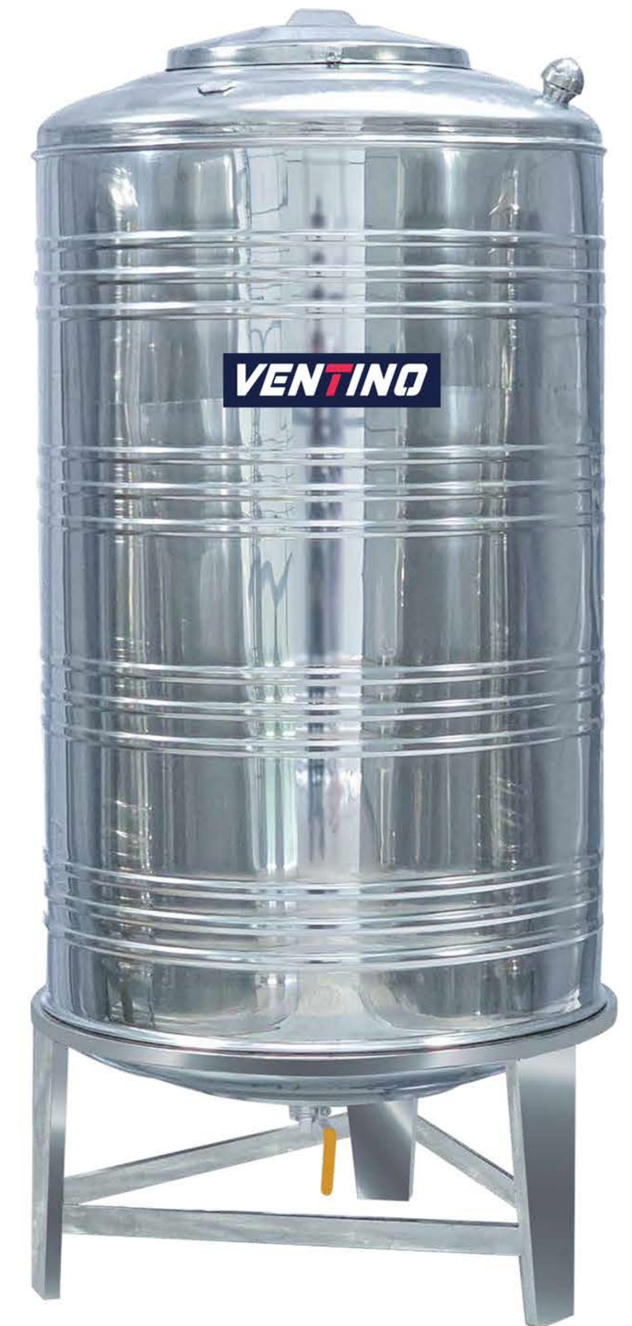
600 Ltr Vertical