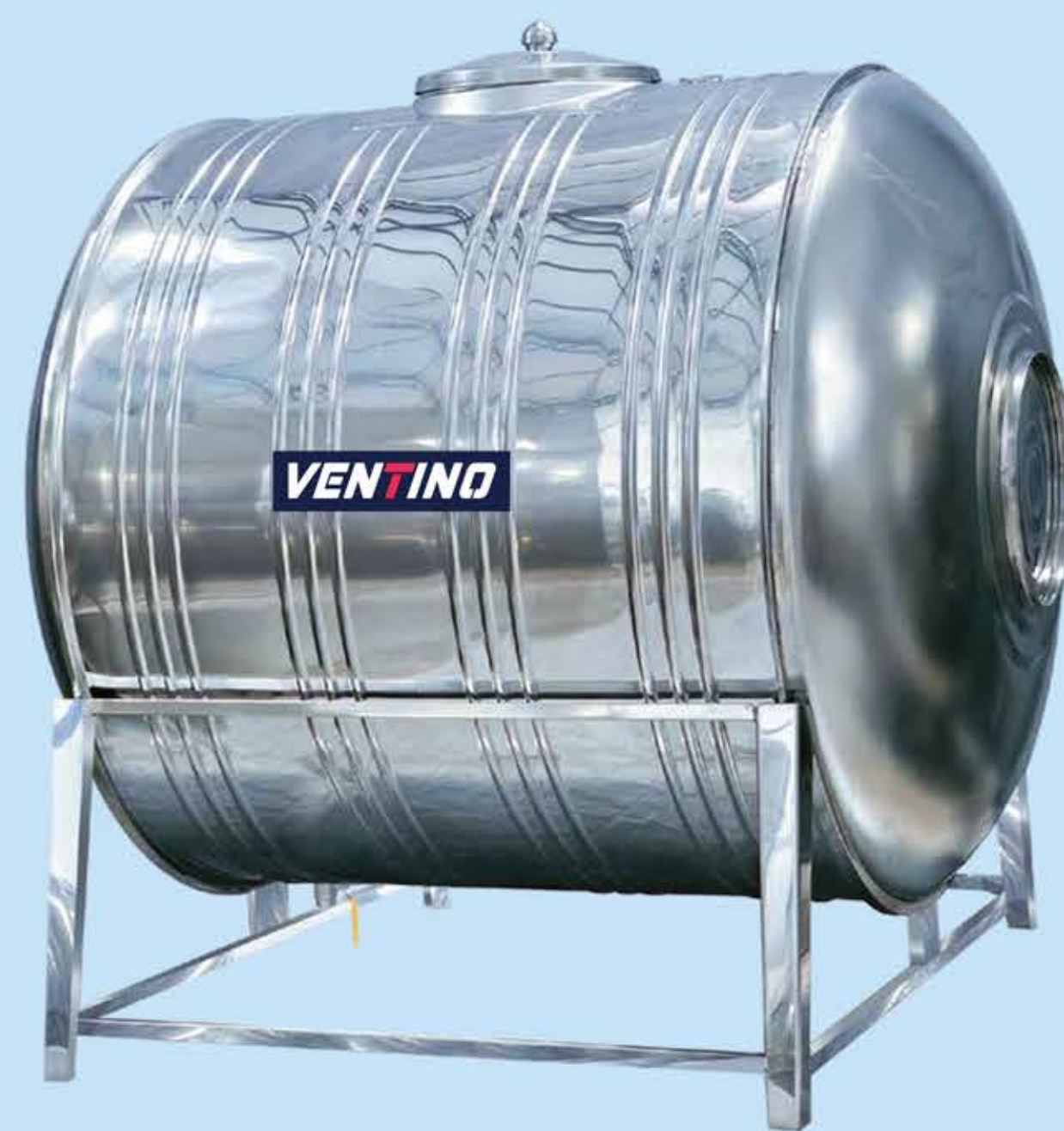
2000 Ltr Horizontal