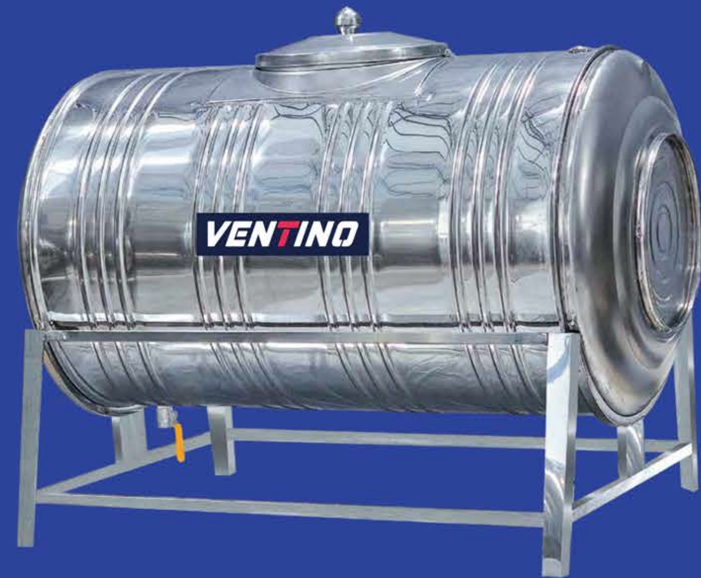
500 Ltr Horizontal