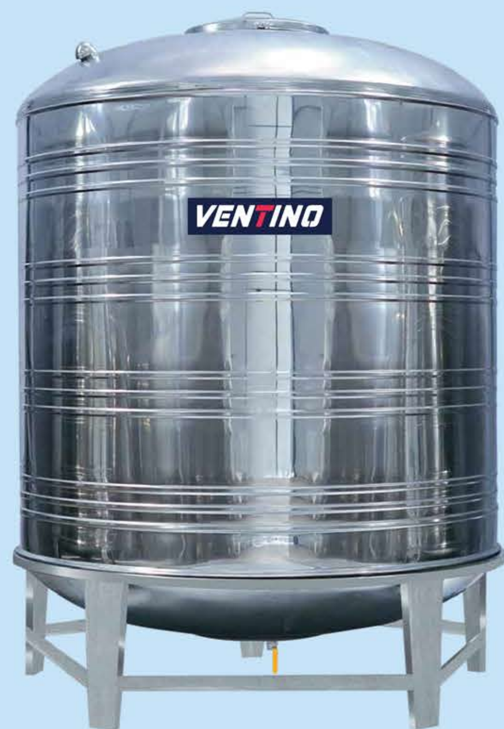
2000 Ltr Vertical