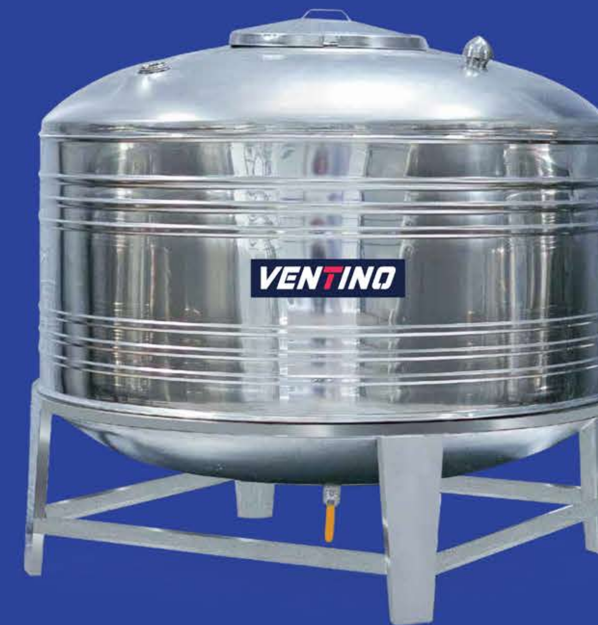
750 Ltr Vertical-sm