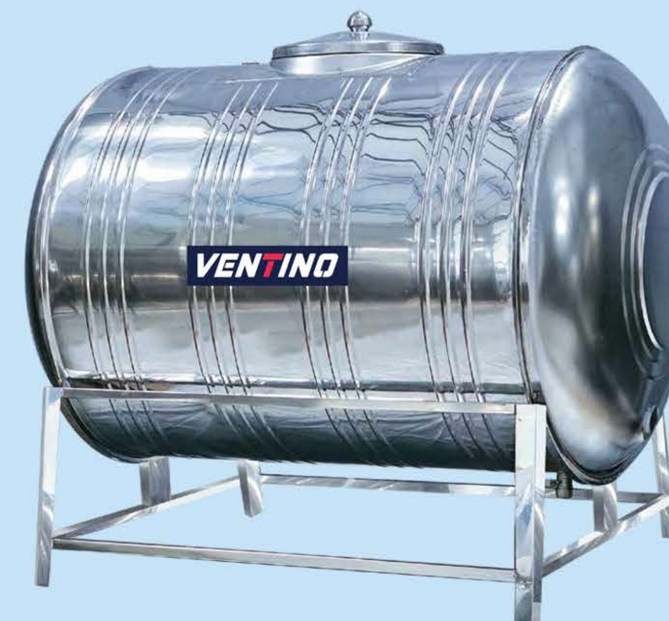
1000 Ltr Horizontal