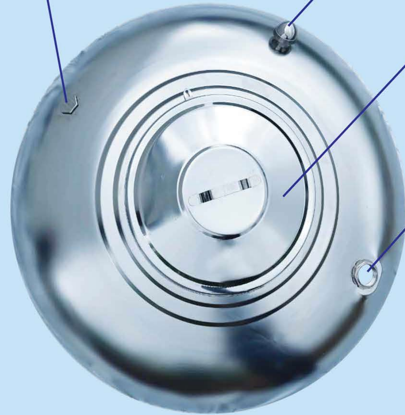
Top Dish of Vertical Tank