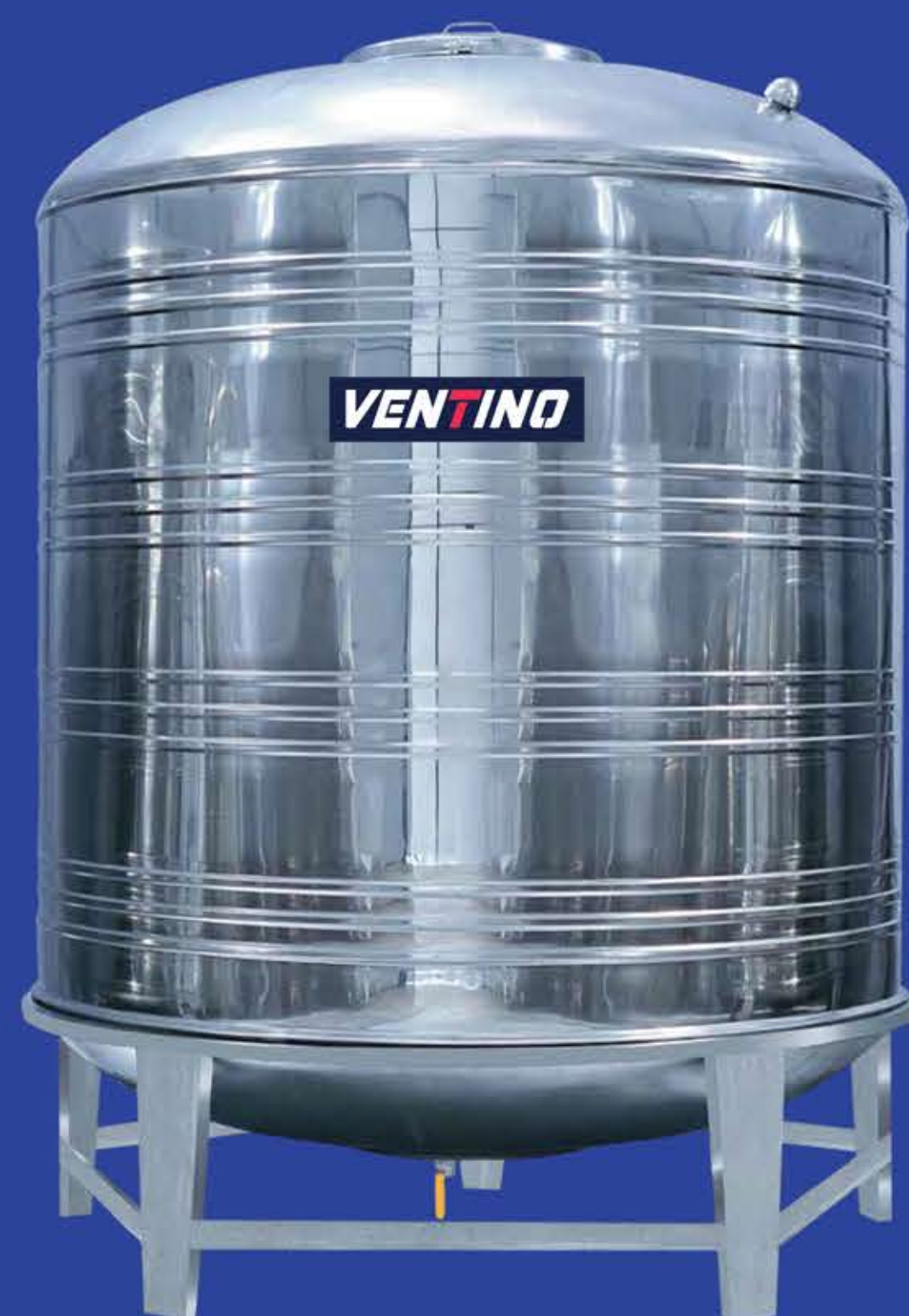
2250 Ltr Vertical