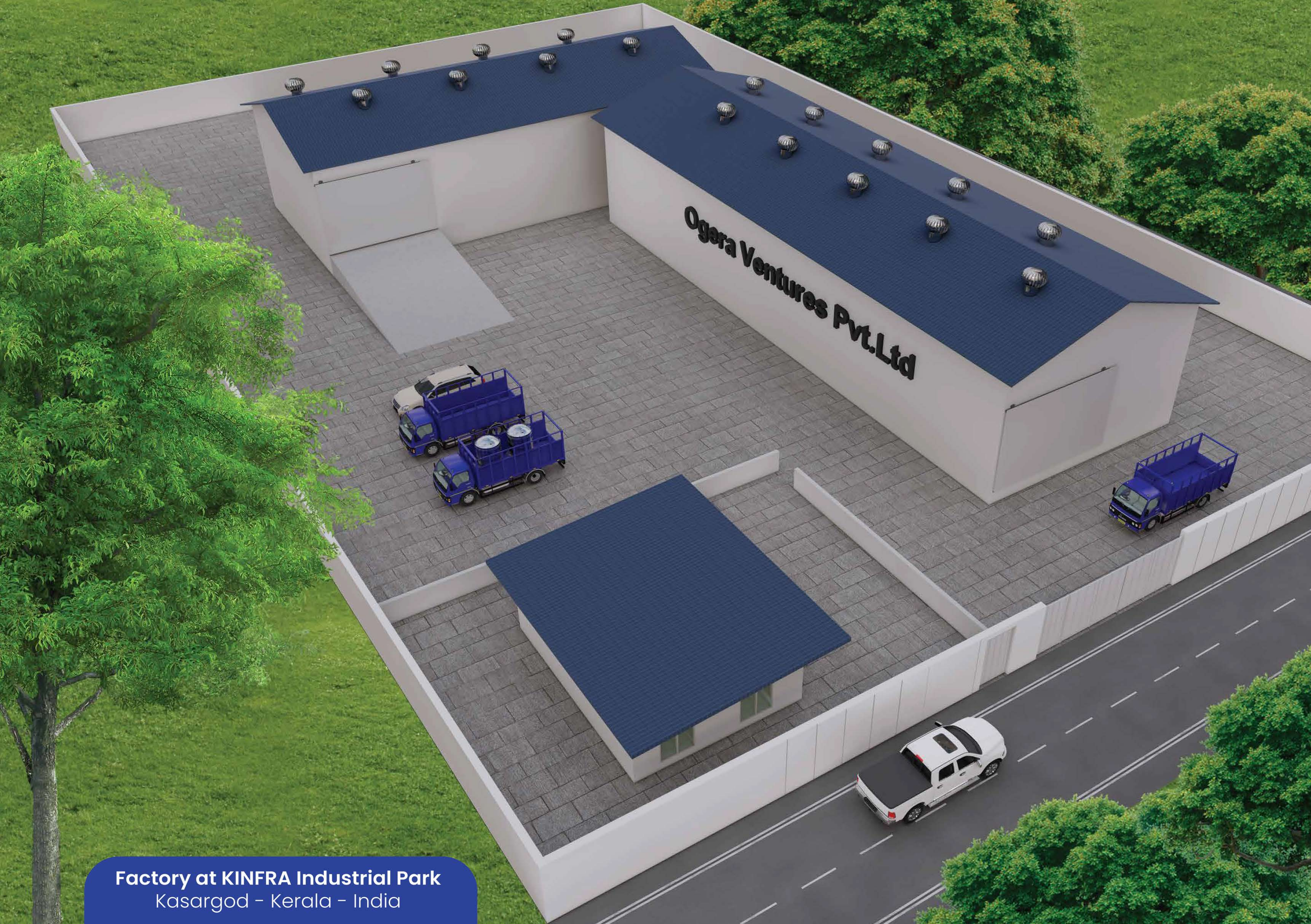
Factory at KINFRA Industrial Park Kasargod – Kerala – India