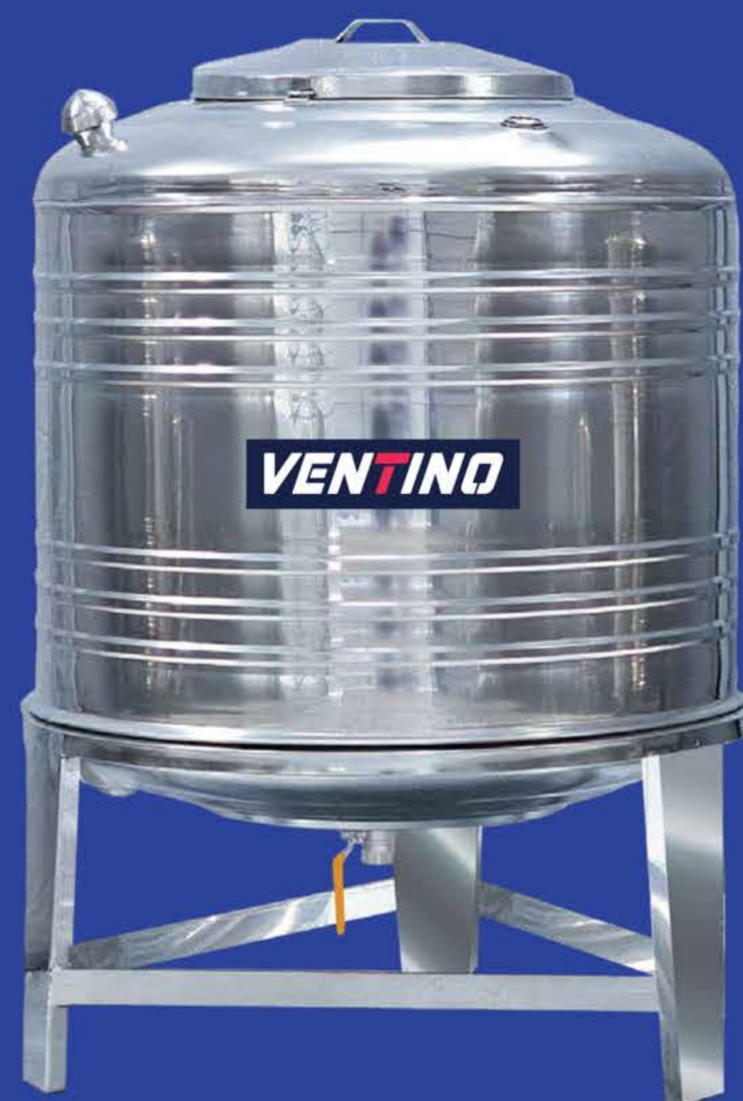
300 Ltr Vertical-sm