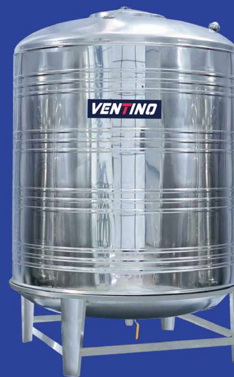
1500 Ltr Vertical